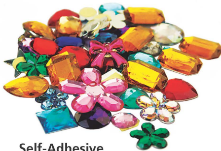
Self-Adhesive Acrylic Gemstones