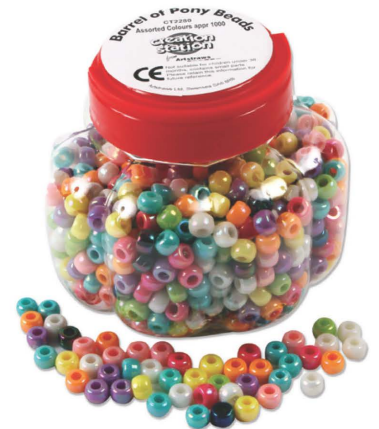
Bright Pony Beads