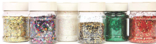
Tapestry Mix Sparkles & Spangles