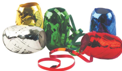
Metallic Narrow Ribbon Spools