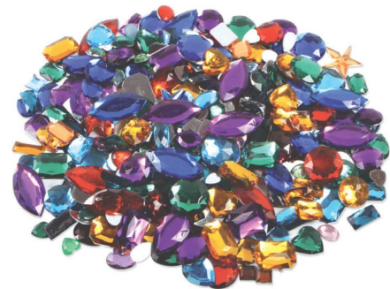
Plain Backed Acrylic Gemstones