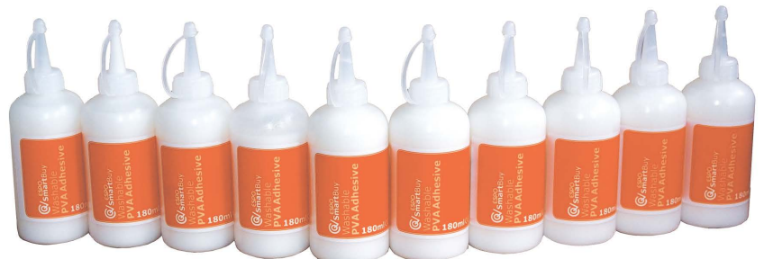
PVA Washable Adhesive